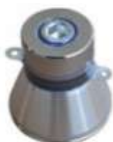
BJC-25100T -68HS PZT-4