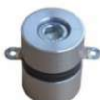
BJC-12060T -40SS PZT-4