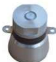
BJC-4060T -48SS PZT-4