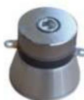
BJC-28100T -68HS PZT-4