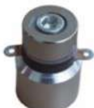
BJC-6860T -49SS PZT-8