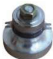
BJC-25(40)/50T -64HS PZT-8