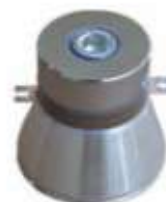
BJC-2860T -59HS PZT-8