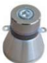
BJC-2560T -59HS PZT-4