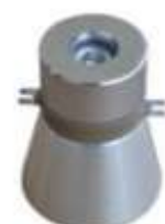
BJC-4060T -49HN PZT-8