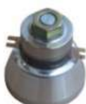
BJC-5435T -38HN PZT-4