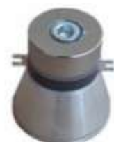
BJC-28120T -68HS PZT-4