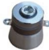
BJC-4060T -49HN PZT-8