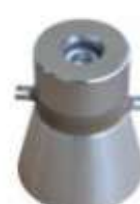
BJC-20100T -68HN PZT-8