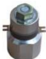
BJC-2850T -45SS PZT-4