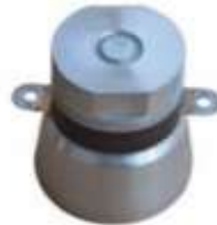
BJC-4060T -48SS PZT-4