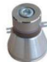
BJC-28100T -68HN PZT-8