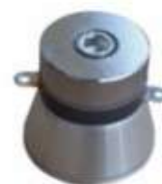
BJC-28100T -68HS PZT-4