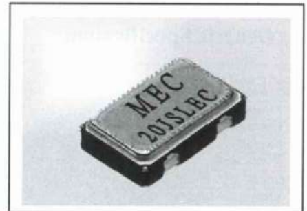
External Dimension (Unit: mm)